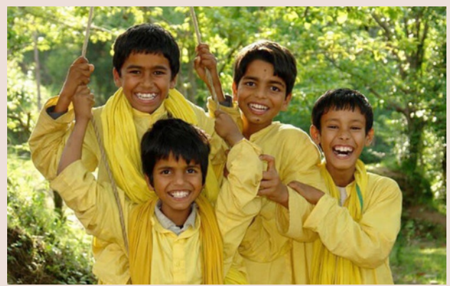
Students of Gurukul