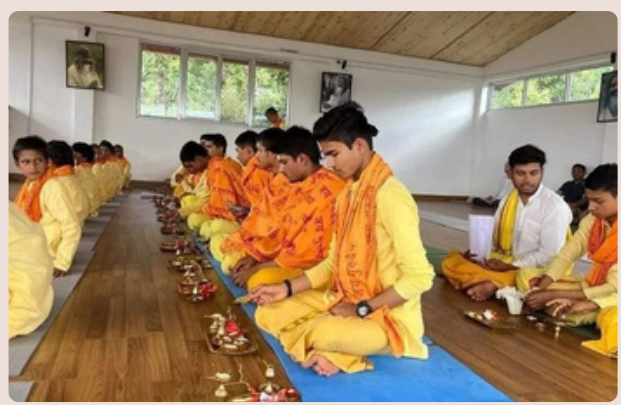
students practicing puja rituals

While modernity has provided some facilities,